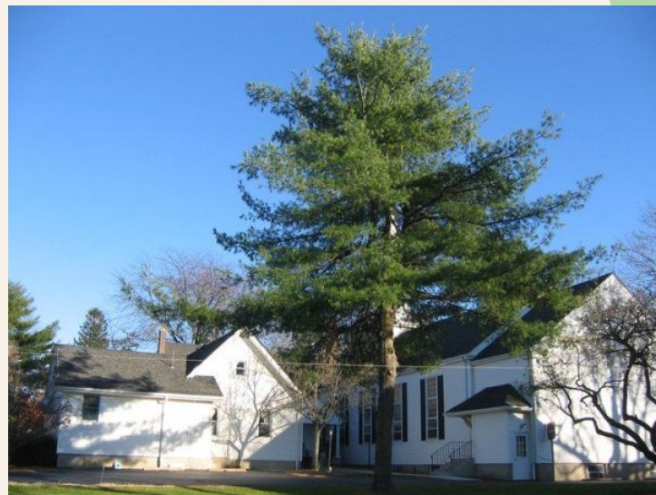
Stanton Learning Center